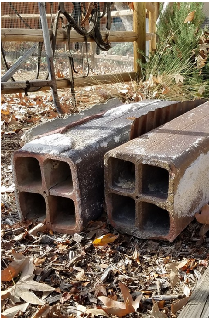
Clay drainage pipes like the ones above were stacked and mortared together much in the same way that blocks are used today. These were used in the reconstruction of the old Mission Store in 1909. The same technique and materials were used to build the old "water building" at the Vail Headquarters. Typically plaster was applied to both interior and exterior walls. See story beginning on Page 1.