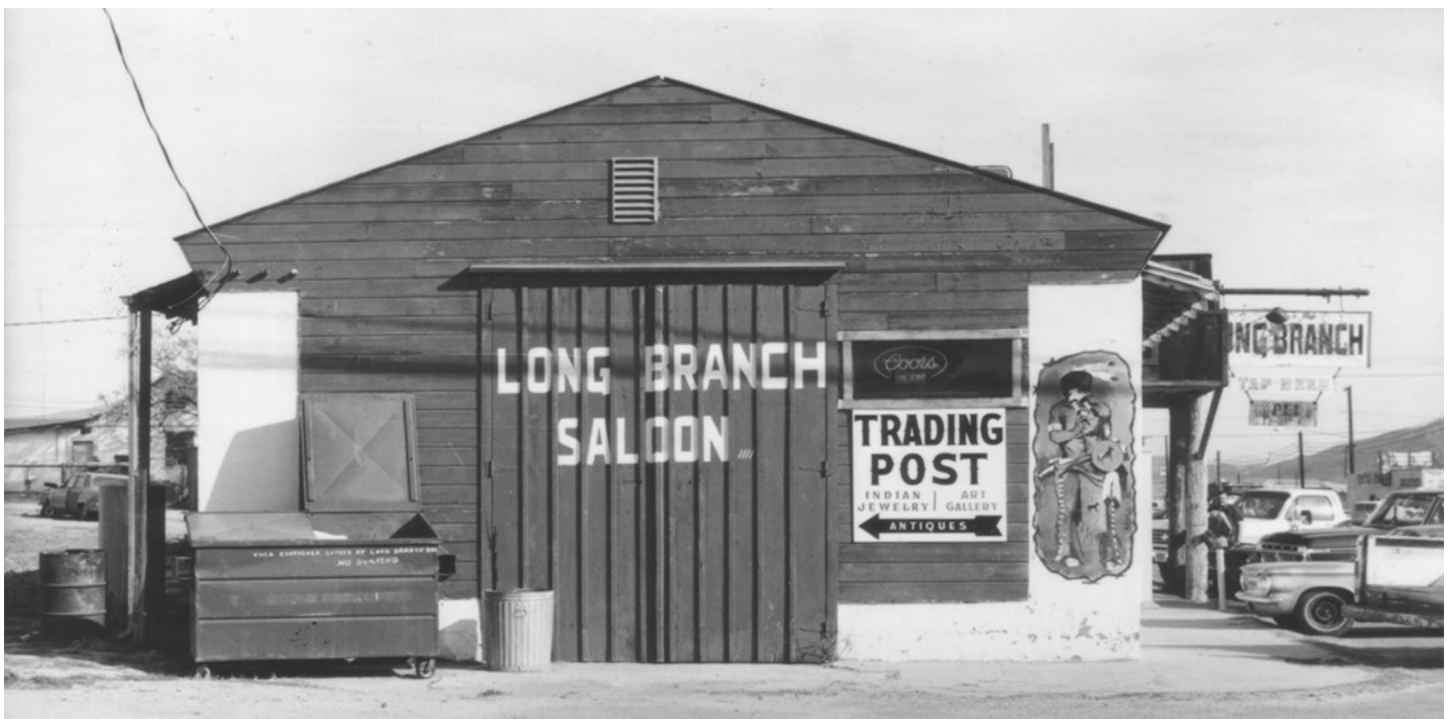
Long Branch Saloon had a storied past in the old building during the 1960's and 70's. It is said that at times various groups ranging from Hells Angels, cowboys, and others laid claim to it as "their bar".