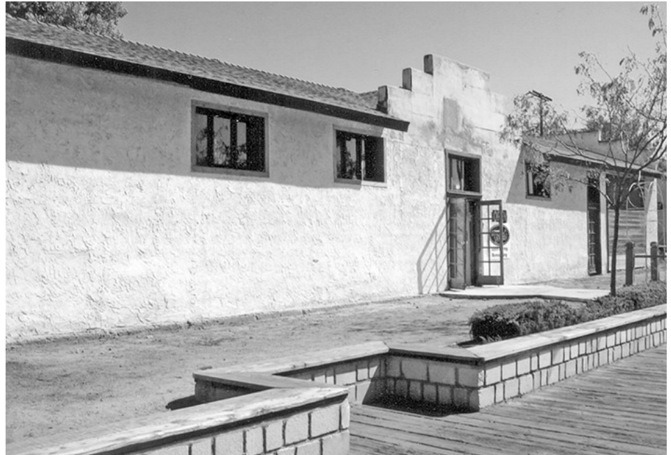
For many years this photo is what we saw at the corner of Main and Old Town Front streets, as Ms. Chievious ladies' clothing