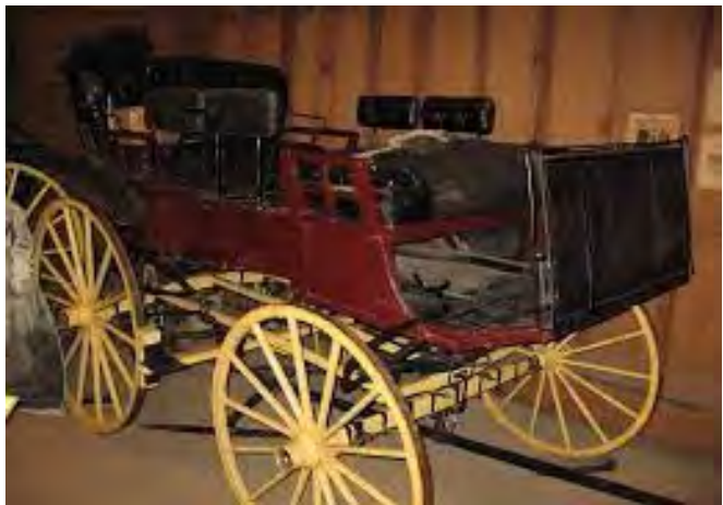
Vail Park Wagon which can be seen at the Seeley Stable's Stagecoaches and Freight Wagons Museum in Old Town San Diego