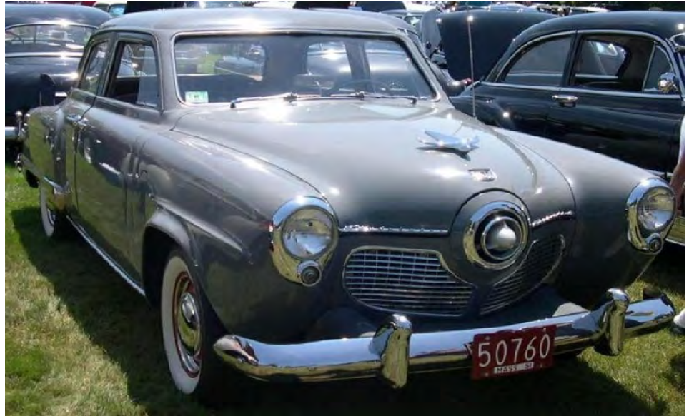
A 1950's vintage Studebaker with "torpedo nose" feature . . .