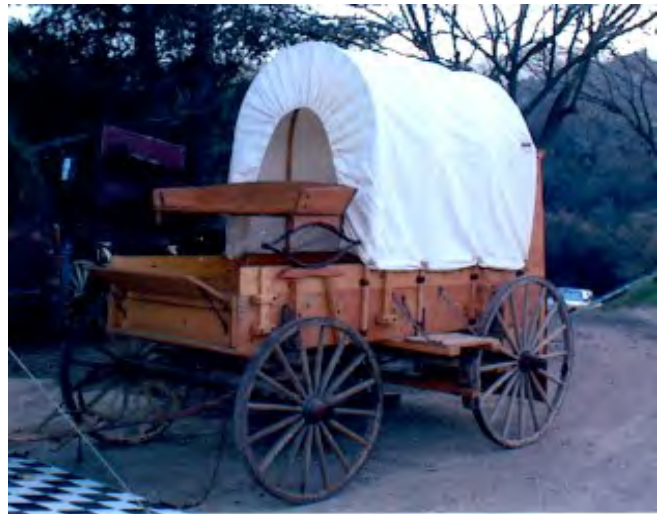
Finished restoration of Studebaker wagon, was converted into Chuck Wagon, now part of TVHS collection

A second example is part of the TVHS collection at the History Center. A number of years ago while Darell Farnbach, Rhine Helzer and Dick Fox were beginning the restoration work on an old wagon from Tony Tobin's collection it was discovered that the Studebaker name was stamped in some of the metal work in the axle area. The undercarriage of the wagon was in fairly good shape, but the upper wagon bed was rotted and needed replacing. As part of that restoration the wagon was converted into a "chuck wagon" consistent with the era and days of Vail ranching.