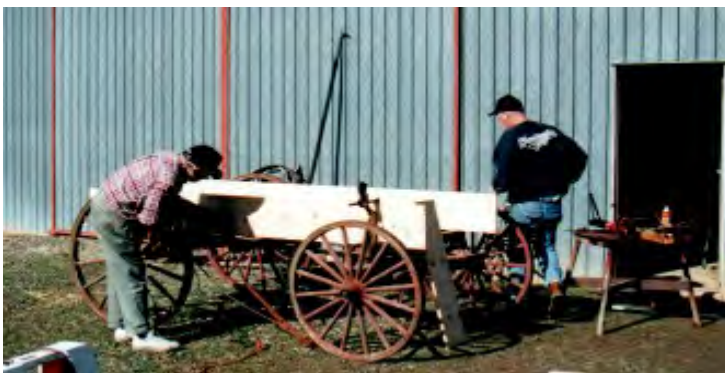
Dick Fox and Rhine Helzer during restoration of Chuck Wagon